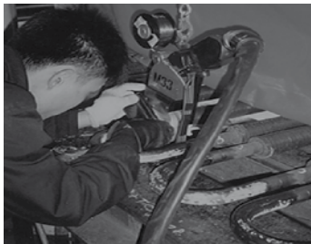
The OP 51 and 102 are also available with electronic arc voltage control (AVC) and oscillation (OSC).

OP series - open weld heads for applications with limited space availability!