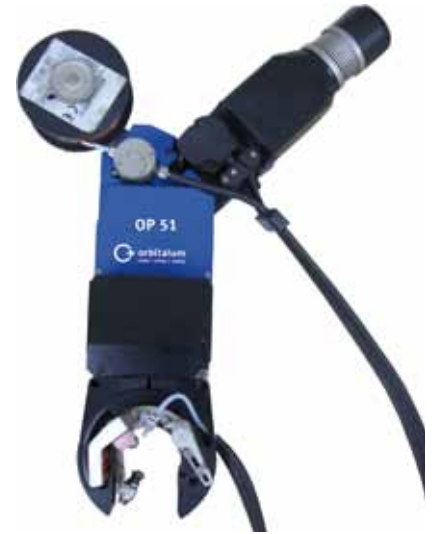
Open weld head OP 51-1

To be able to operate the weld heads, clamping jaws and a suitable earth cable are also necessary, which are not included in the standard delivery and must be ordered separately.