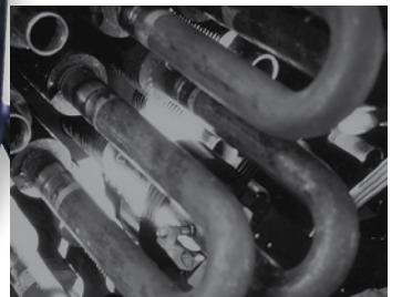
Horizontal, vertical and tilted welding positions are possible. Simple and fast assembly of the weld heads on the tube.