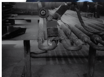
Gas, water and electricity supply through a multiple hose made of viton enables safe and user-friendly working.