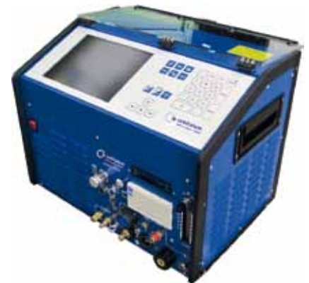
ORBIMAT 300 CB