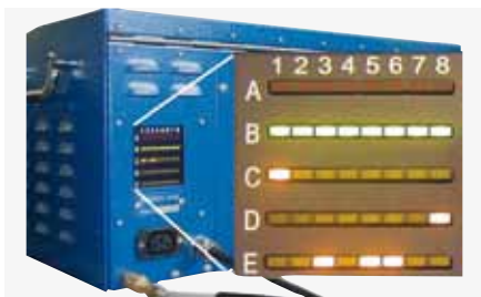
PSS Pro-Service System: Simple functional test with no need to open the unit