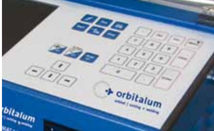
High quality function and numeric keypad