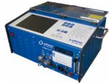
ORBIMAT 165 CB