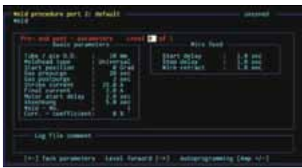
Multilingual menu navigation via color display