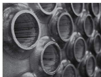
Up to 30° continuous swivelling TIG torch. Rotating wire feed unit at torch axis.