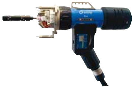
Tube-to-tube-sheet weld head P16

The hose package length is 7.5 m (24.6 ft). For extension cables see on page 40.