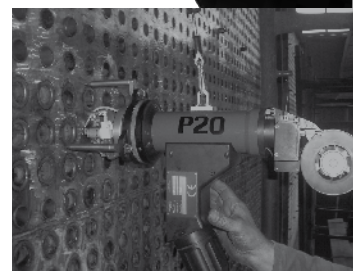
Easy and safe handling with most functionality. Precise centering by means of exchangeable mandrels.