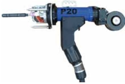
Tube-to-tube-sheet weld head P20 with cold wire

The hose package length is 7.5 m (24.6 ft). For extension cables see on page 40